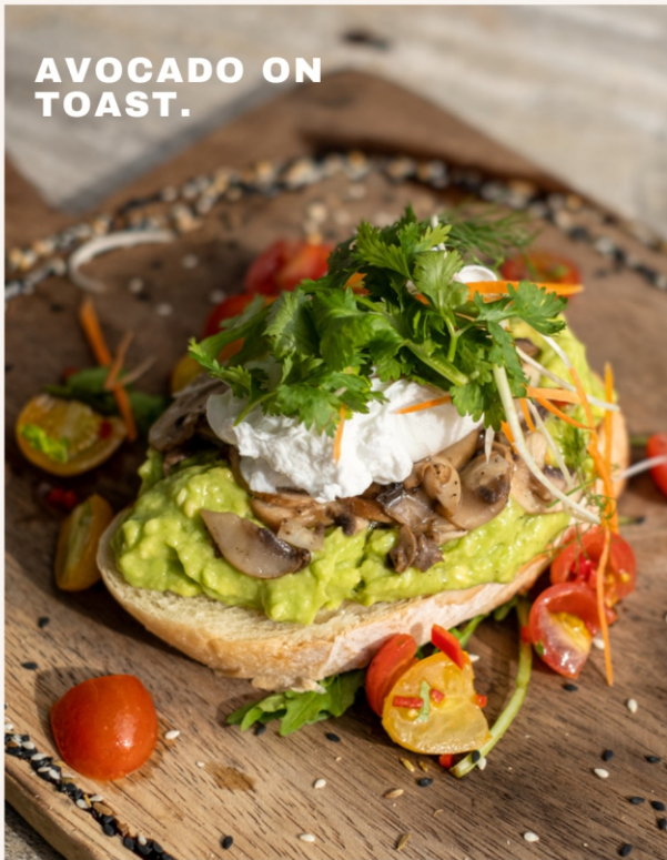
AVOCADO ON TOAST.