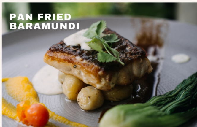
PAN FRIED BARAMUNDI

KUNG PAO CHICKEN 80K Chicken in flour, leek, cashew, chili and kung pao sauce