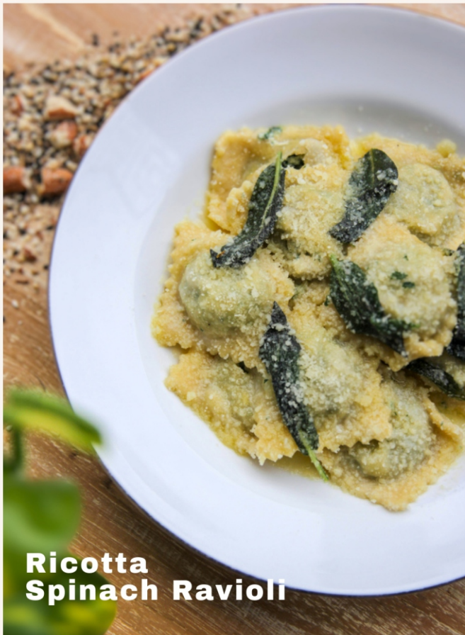
Ricotta Spinach Ravioli

Squid, fish and shrimp, pesto sauce, red capsicum, mozzarella cheese